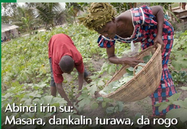
Abinci irin su: Masara, dankalin turawa, da rogo