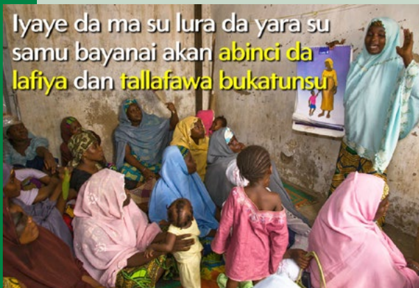
Iyaye da ma su lura da yara su samu bayanai akan abinci da lafiya dan tallafawa bukatunsu