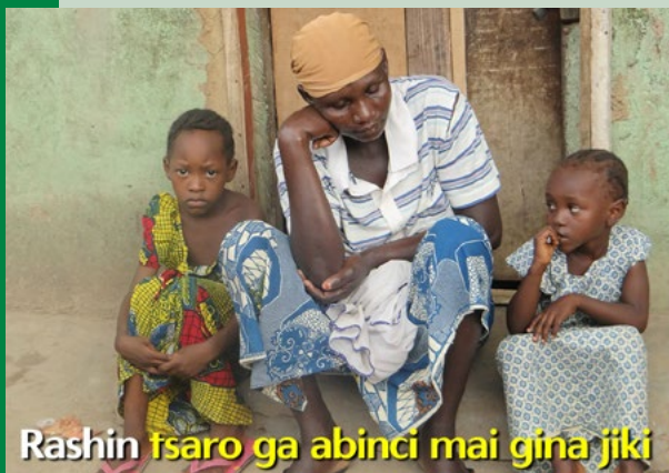
Rashin tsaro ga abinci mai gina jiki