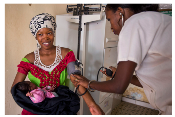
A nurse takes the blood pressure of a young mother in Senegal.

Another opportunity for integration is to provide cervical cancer screening to high-risk young women who come in for SRH or HIV/AIDS services. Although universal screening for cervical cancer is generally recommended only for women starting at age 25 or older, the International Federation of Gynecology and Obstetrics (FIGO) recommends screening for all women with high risks, including HIV-positive women and those who have had early sexual exposure, multiple partners, or previous abnormal cervical cancer screening results. Screening for cervical cancer (using visual inspection with acetic acid followed by timely treatment of precancerous lesions) is one of WHO's Best Buy interventions for the prevention and control of NCDs.<sup>27</sup> In addition, young pregnant women should be screened during antenatal care visits for GDM and hypertensive disorders (that lead to preeclampsia and eclampsia), both significant causes of maternal and child deaths and illness in LMICs. FIGO recommends universal screenings among pregnant women for both GDM and hypertensive disorders, yet in many settings, they are not always done.<sup>28</sup> Results of all screenings can be used to offer appropriate counseling, referrals, or treatment.