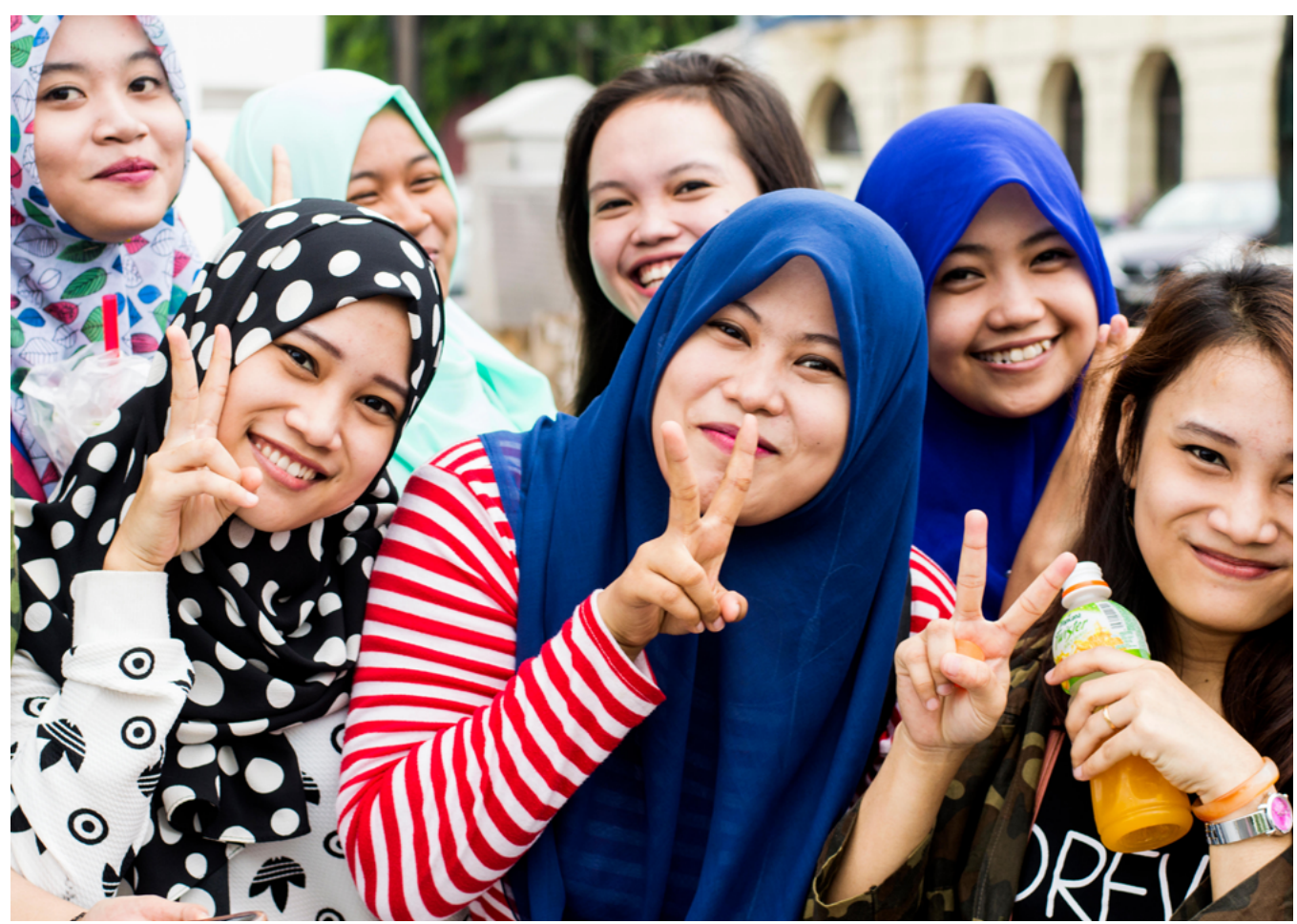
Young women in Malaysia.

Noncommunicable diseases (NCDs) are the leading causes of death in high-income countries, and also in many low- and middle-income countries where they account for almost three-quarters of all global deaths from NCDs. Compared to high-income countries, deaths from NCDs in low- and middle-income countries are far more likely to occur prematurely—before the age of 70—when individuals are typically at their peak economic productivity (30 percent of all NCD deaths in high-income countries are premature versus 48 percent in low- and middle-income countries). Beyond the effects on health, premature death disrupts the social and financial well-being of families, and hinders national economic growth and sustainable development.