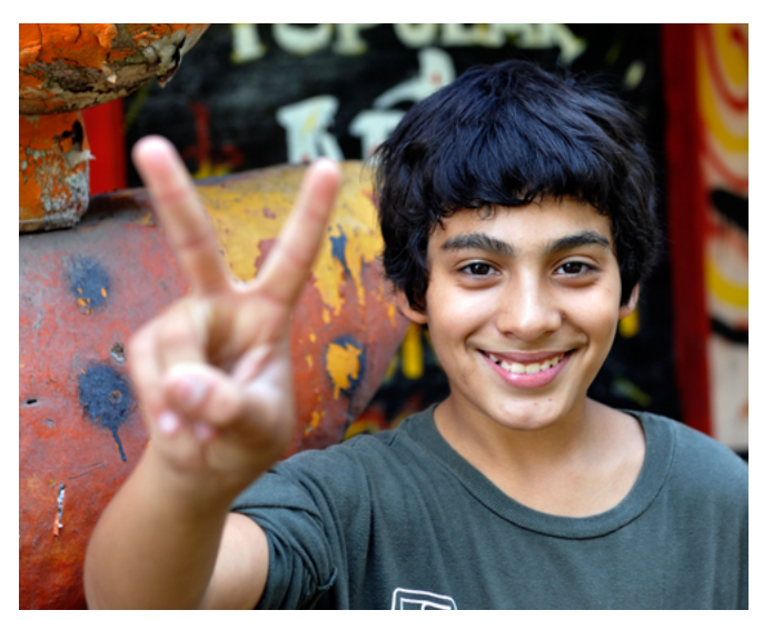
Young Argentine man making the "victory" sign.

impacts of their behaviors. They may even be more receptive to integrated NCD and SRH messages. For example, pregnant young women accessing MCH services may be particularly motivated to act on advice to stop smoking or drinking to ensure the health of their babies. Similarly, young people seeking SRH services may be more receptive to counseling about heavy drinking when they realize that it could reduce their chances of having unplanned pregnancies or contracting STIs, including HIV.