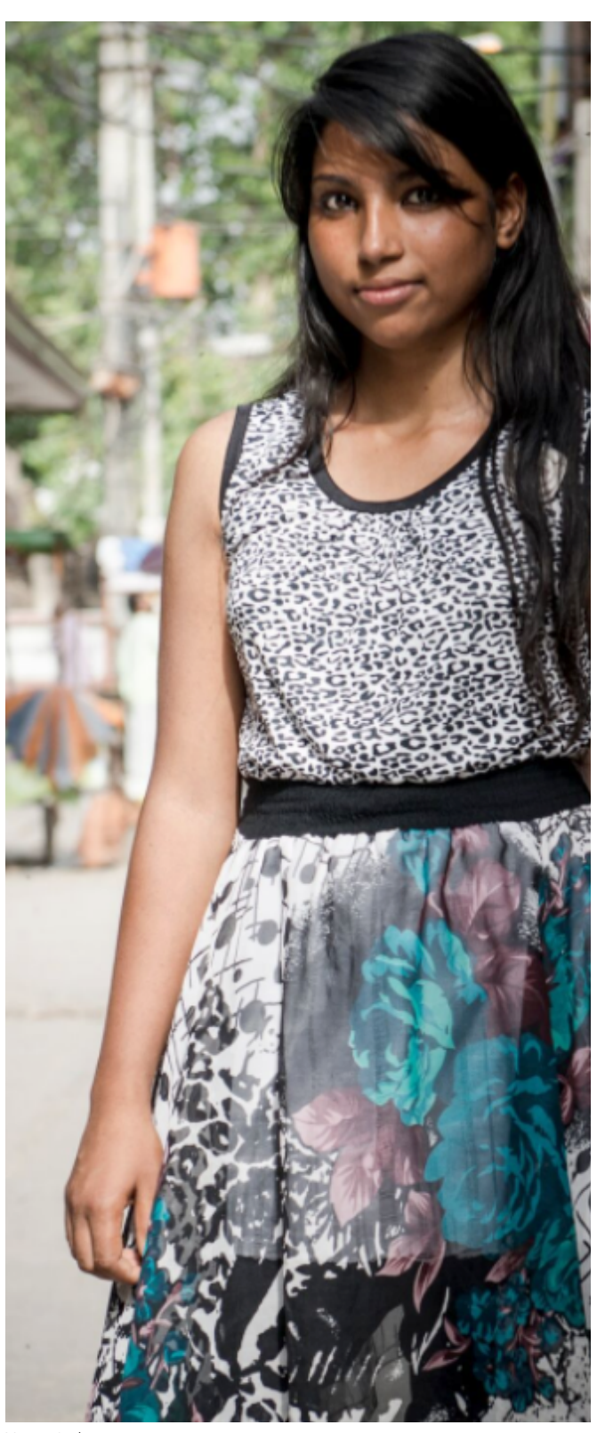
Young Indian woman.

and East Asia have the highest prevalence of hepatitis B with rates of chronic infection between 5 percent and 10 percent in the adult population. Hepatitis B vaccination to prevent liver cancer is on WHO's Best Buy list of interventions for prevention and control of NCDs and is recommended universally at birth, and also for all children below age 18 who have not previously been vaccinated if they live in countries where hepatitis B is at low or intermediate levels.31