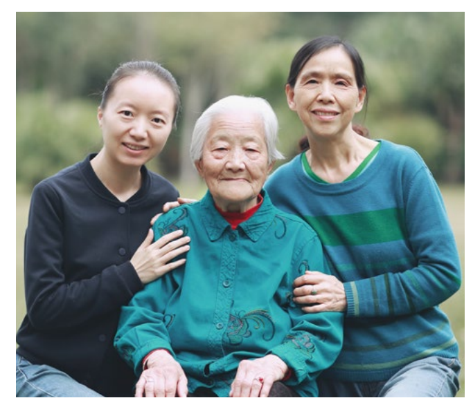
Rising education and better medical care have improved health, reduced gender gaps in health at older ages, and increased life expectancy.

Rising obesity rates and high smoking prevalence (among men) also present major health challenges for China's aging population. In 2011, 28% of men and 38% of women ages 45 and older were overweight, putting them at higher risk of heart disorders, hypertension, diabetes, and stroke.8 Over half of men ages 45 and older (53%) smoked in 2011, compared with 5% of women in that age group.9 High levels of pollution—especially in urban areas—pose additional health risks.