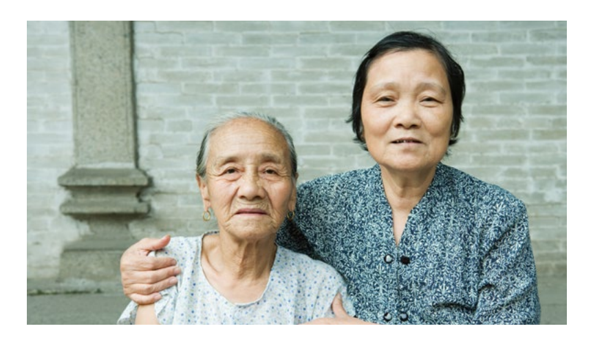
Despite increases in education levels, older Chinese women are about three times more likely to be illiterate than their male counterparts.

Women's childbearing patterns help explain the gender gap in health at older ages. Prior to the implementation of China's one-child policy in 1980, women commonly had many children and started bearing them at a young age, which can negatively affect women's health. Researchers have found that these effects can carry over into old age: Chinese women with four or more children are more likely to experience disabilities