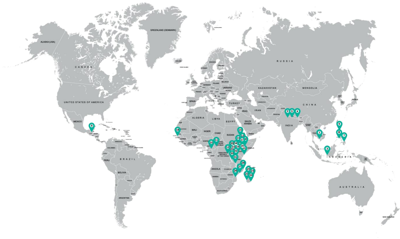
FIGURE 1 LOCATION OF PHE PROJECTS INCLUDED IN REPORT