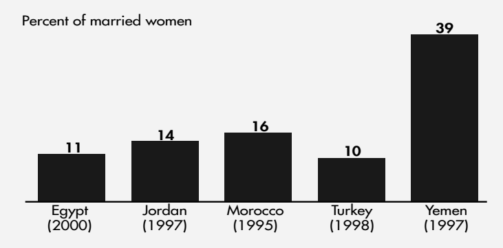
Figure\ 3 Married Women Who Would Prefer to Avoid a Pregnancy But Who Are Not Using Contraception

sources: ORC Macro, Demographic and Health Surveys.