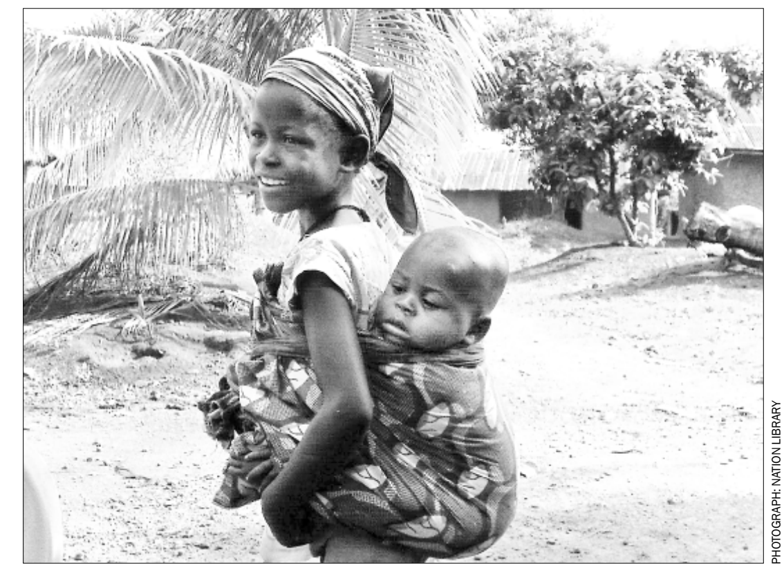
Babies are born in risky conditions as a result of frequent power failures at Ndirande Health Centre

She said the white lady (a British national with some medical background) shouted at her for trying to 'stitch' a woman with candle waxoblivious of the fact that the health worker was not stitching