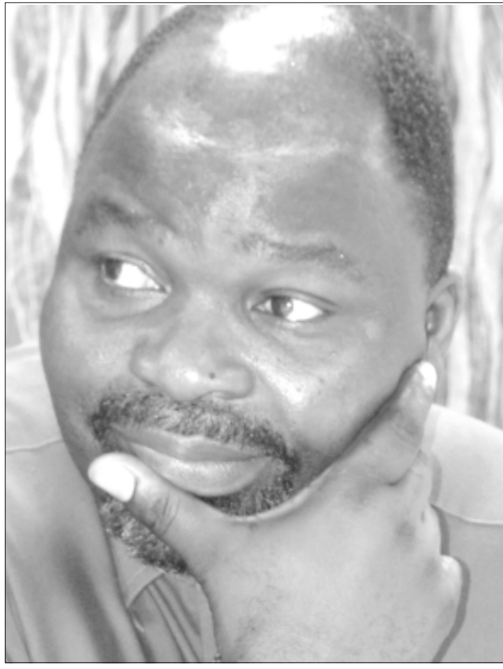
Taulo: It is time for a holistic approach

For instance, in the rural areas, lack of adequate male