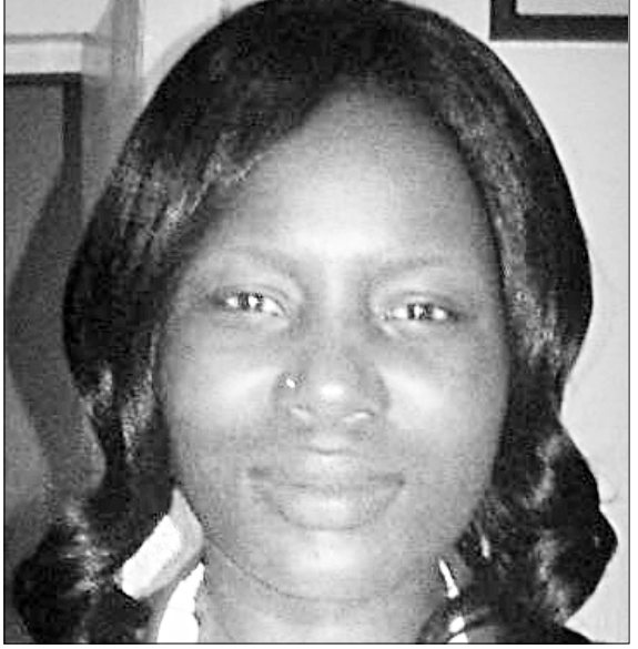
Kayira: Women who are HIV positive could infect their babies if they deliver at TBAs

A visit to some of the health centres such as Therere revealed that there are less than three beds in the maternity