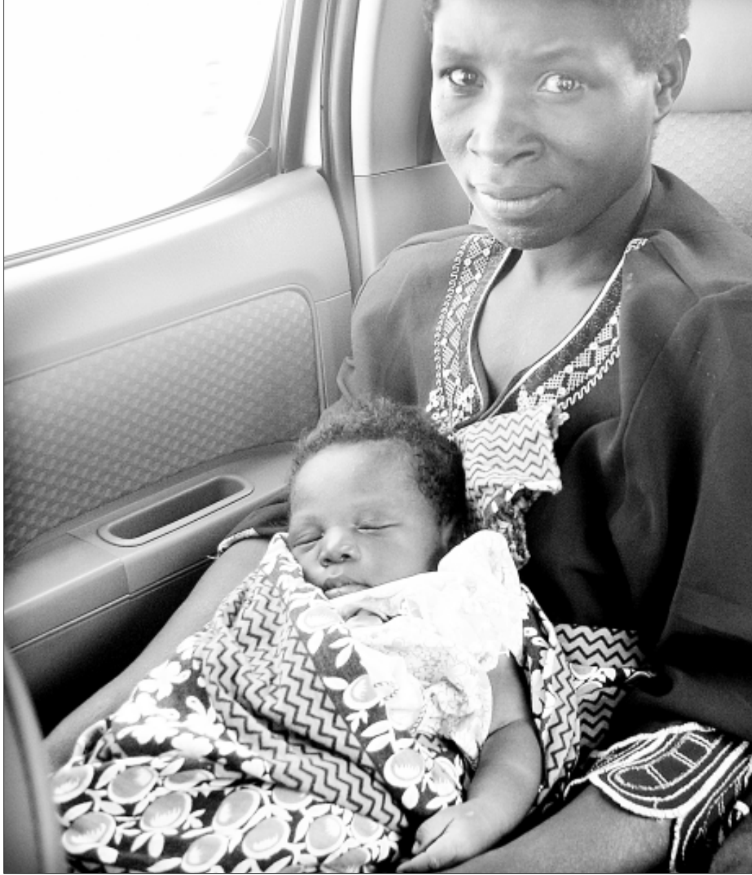
Giving birth in hospitals ensures healthy babies

"How do we convince women to go to the nearest hospital if the facilities lack basic necessities as beds?" queried Chikweo, requesting government and non-governmental organisations to help ease the problems.