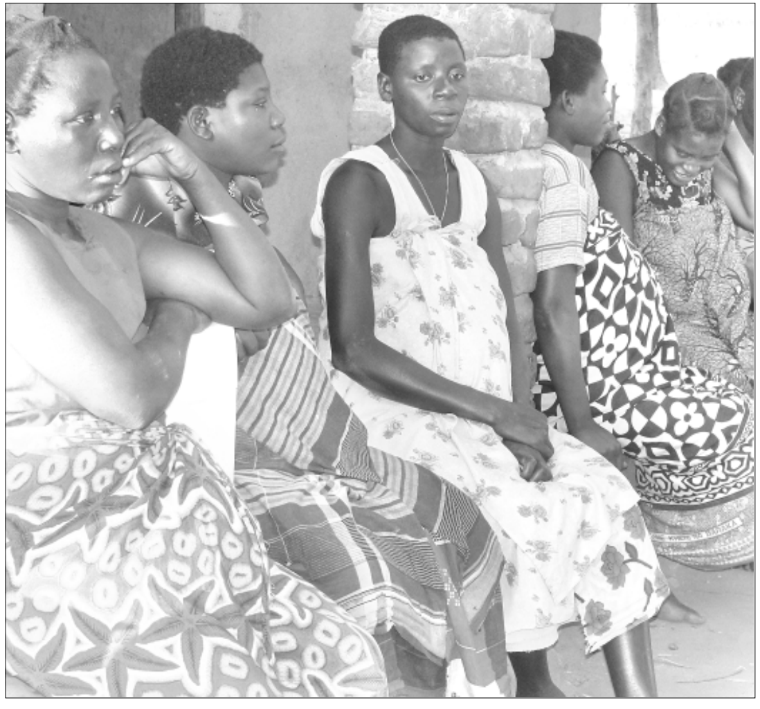
Women need to be informed in family planning issues to avoid unplanned pregnancies

Family planning allows individuals and couples to anticipate and attain their desired number of children and the spacing and timing