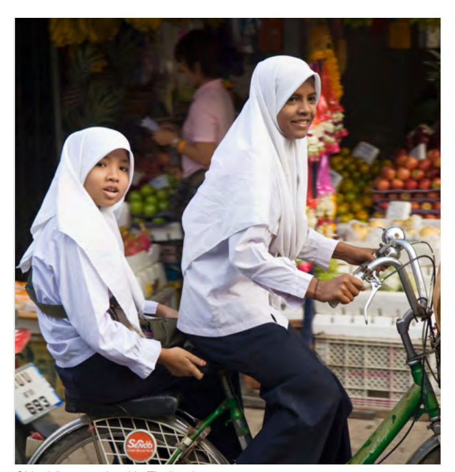
Girls riding to school in Thailand.

■ Healthy Diet: Home, school, and community gardens offer an important way to address the double burden of malnutrition. They offer an opportunity for young people and others to learn about proper nutrition and to improve access to fresh, vitamin-rich fruits and vegetables needed to combat malnutrition and reduce the risk of overweight and obesity. An initiative called Vegetables Go to School is establishing comprehensive school vegetable gardens in selected countries, including Bhutan, Indonesia, Nepal, and the Philippines. The latter has seen the greatest success thus far: Fifty-eight percent of 46,000 elementary and secondary schools nationwide have functioning school gardens.57