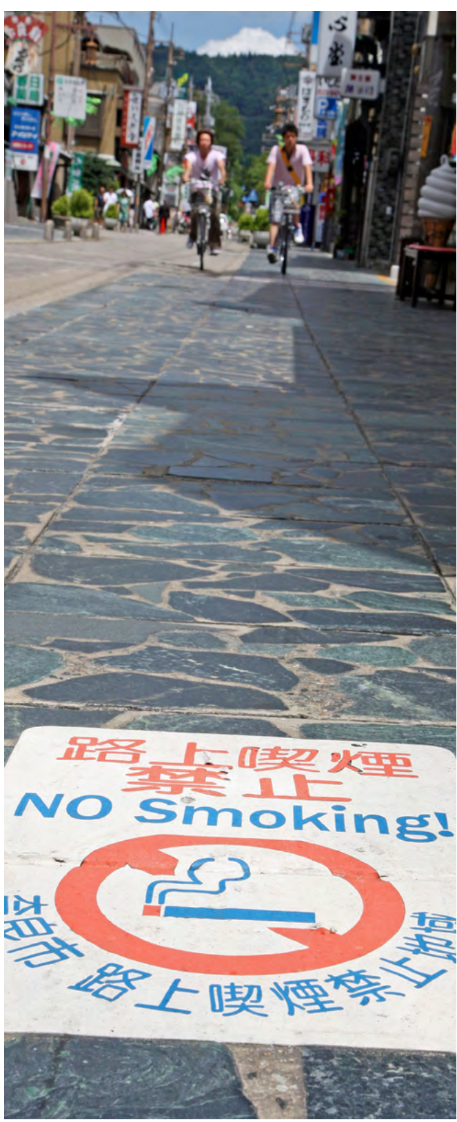
Japanese no-smoking sign on the road.