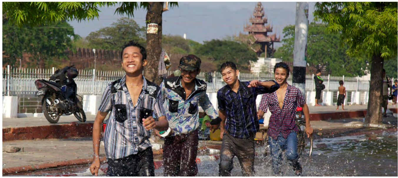
Boys during Myanmar's Water Festival.

The importance of focusing on youth is underscored by the fact that Asia is home to 981 million young people ages 10 to 24—more than half of the world's young population. 16 One in three young people live in either India or China. Globalization, urbanization, and socioeconomic development are driving a rise in NCD risk behaviors among this large cohort of voung Asians, setting them up for poorer health in adulthood compared to today's adults. Given that this young cohort is also much larger than the older cohorts they will replace, a window of opportunity exists to curb their risk behaviors now to shift the projected trajectory of NCDs in Asia. In 2050 when today's young people have all reached ages 45 and older—the time when NCDs typically hit hardest—the over-45 population is projected to be 2.3 times the size it is today in South Asia, 2 times larger in Southeast Asia, and 1.4 times larger in East Asia. Left unchecked, NCD risk factors among young people today could translate into large NCD epidemics in the future.