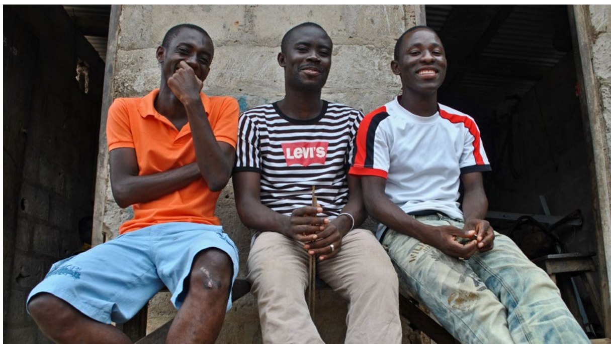
Teenage friends in Ivory Coast.

Dans cette optique, la présente déclaration de politique nationale de la santé de la reproduction repose sur des valeurs essentielles suivantes: la solidarité, l'équité, l'éthique et le respect de la spécificité du genre.