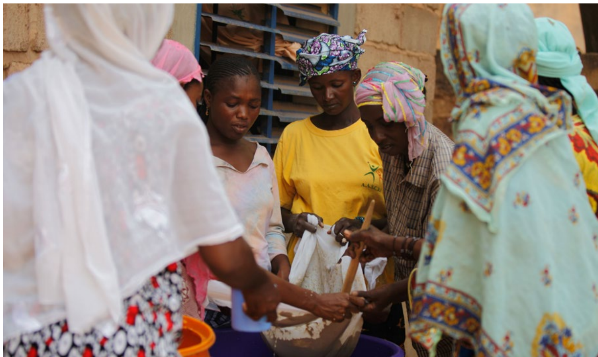
In Ouagadougou, Burkina Faso, Fulani women work together to make a traditional millet drink for a baby's baptism party.

Burkina Faso has a strong policy environment for the provision of youth-friendly FP services. Burkina Faso falls in the green category for this indicator.