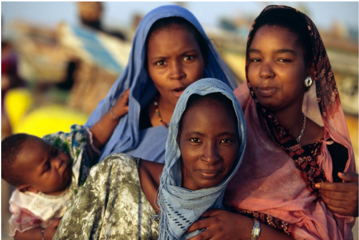
Mauritanian women.

However, no law or policy exists that prohibits parental or spousal consent for youth access to FP services. Mauritania is placed in the gray category for this indicator.