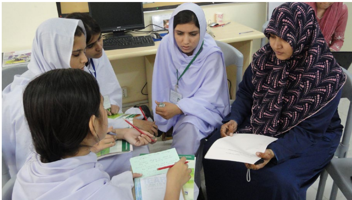
AYV Workshop at iEARN Centre, Karachi on 23rd October 2010.

Strategy 3.4: Re-defining links with DoPW (Department of Population Welfare) with shift of contraceptive services through district and urban PHC [primary health care] systems and aimed at birth spacing in younger couples