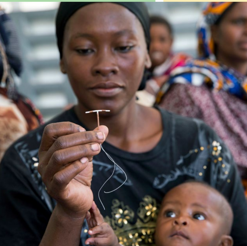
Kenyan woman participating in mobile reproductive health education and services in a Rabai, Kenya.