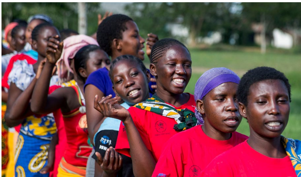
Young mothers, members of a breastfeeding group, gather regularly to discuss sexual reproductive health, and family planning options.

Countries are categorized based on the language in the most recent version of a given law or strategy. For example, a new reproductive health law in a given country is considered to supersede an old reproductive health law in that country. In cases where there is evidence that an older, more restrictive law is still in effect despite a newer strategy that extends access to youth FP, we consider this as an existing policy restriction. In addition, if there are overt inconsistencies across recent policy documents, we consider this as an existing policy restriction.