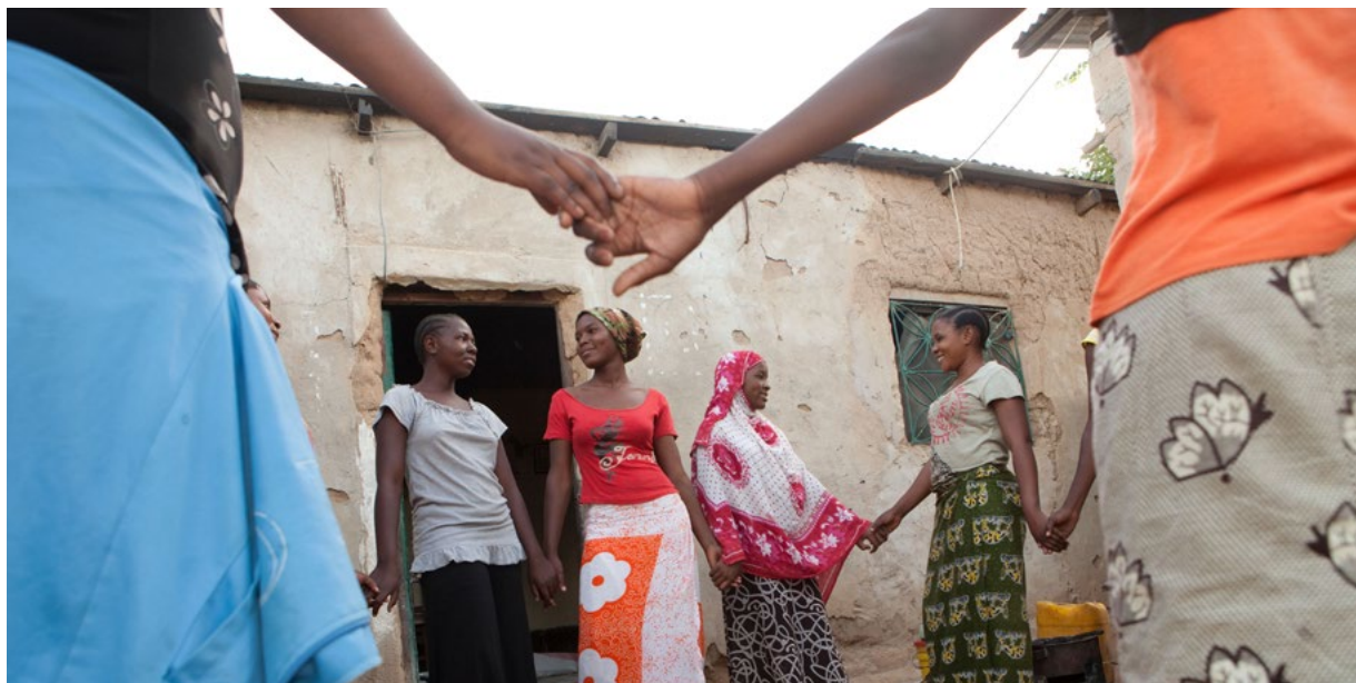
Girls attend an after-school adolescent development program in Dodoma, Tanzania.

Tanzania is placed in the green category because its policies explicitly acknowledge young people’s right to FP services.