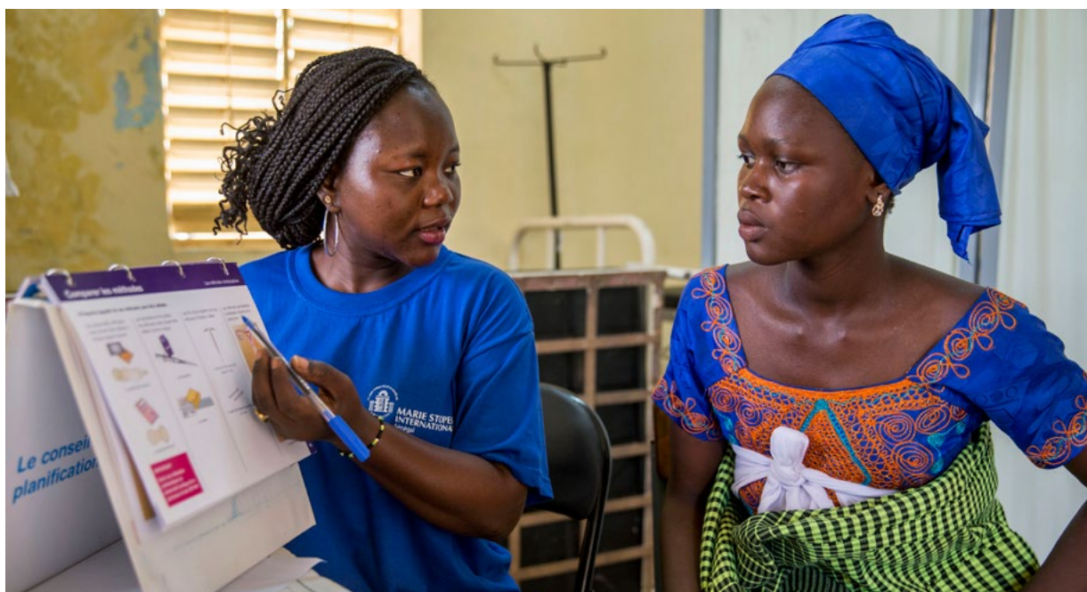
A mobile clinical outreach team on a site visit to Laniar health center, a rural area of Senegal.

Pour le professionnel de santé, le dialogue et la relation de confiance noués avec l'adolescent(e)/jeune sont des déterminants fondamentaux de la qualité de la prise en charge, qu'il s'agisse de diagnostiquer, de dépister et d'informer. En effet, il doit avoir des compétences nécessaires pour communiquer avec les adolescent(e)s/jeunes, détecter leurs problèmes de santé de façon précoce et fournir des conseils et des traitements. Il doit placer les besoins, les problèmes, les pensées, les sentiments, les points de vue et les perspectives des adolescent(e)s/jeunes, au cœur de ses activités... L'accent sera mis sur l'apprentissage et la formation continue.