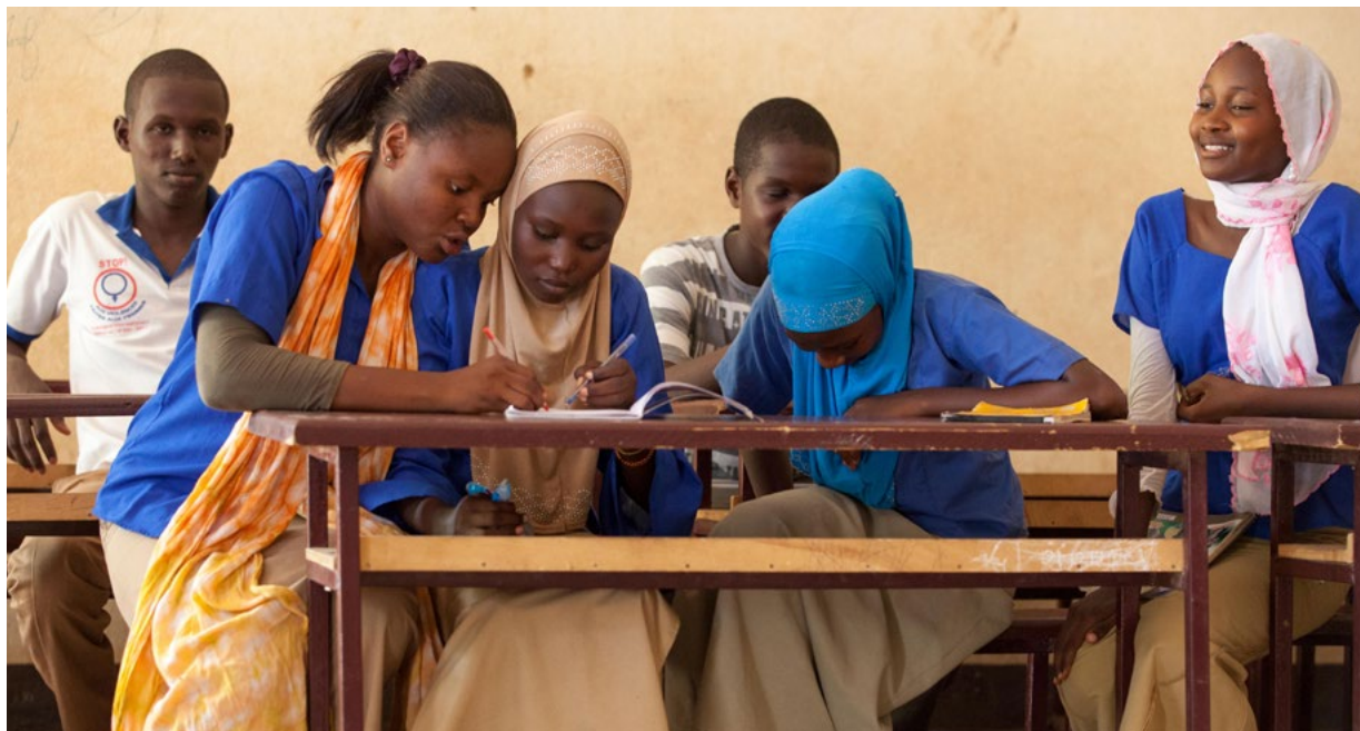
Members of the “Our Future” children’s club at the Secondary School in Tera, Niger.