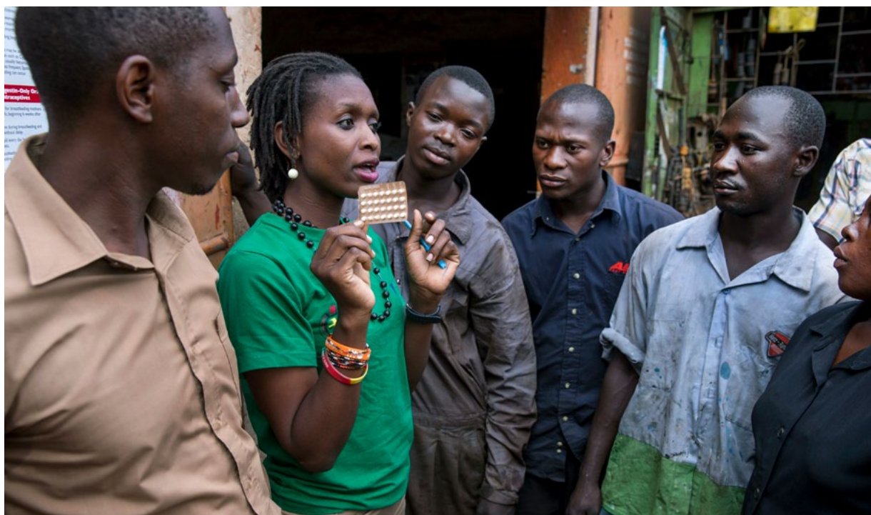
Members of the Muvubuka Agunjuse youth club during an outreach meeting in one of Kampala's slums, in Uganda.

The acknowledgement of individuals’ right to receive SRH services, regardless of age, signals a strong policy environment and warrants categorization the green category for this indicator.