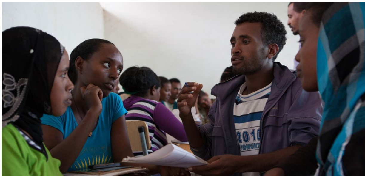
Students talking in a teacher training college, Ethiopia.

Based on these inclusions, Ethiopia is placed in the green category for this indicator. Policy documents directly recognize the rights of young people to receive FP services.