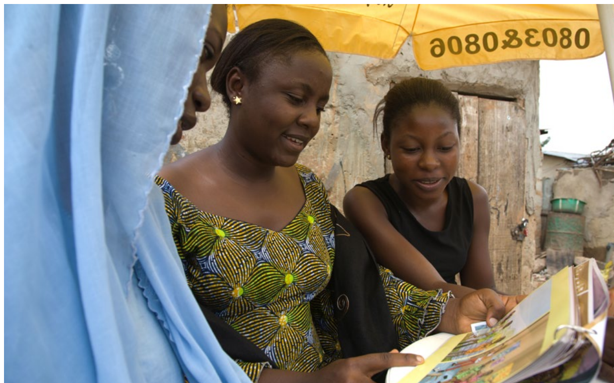
Two female out-of-school youth in the Garki area of Abuja, Nigeria look at a peer educator manual on HIV/AIDS.

SD16. Make PHCs [primary health care centers] youth-friendly. FP providers will be given adequate orientation to enable them to provide youth-friendly FP services. Part of making FP youth-friendly requires providing places where youths can have adequate privacy to receive FP services. When possible, private, youth-friendly service points will be established in existing PHCs. These rooms will be closed off so that the identity of the person inside cannot be viewed from the rest of the facility. The rooms will be furnished with FP materials and necessary supplies. Peer educators trained to dispense pills and condoms will staff the service points.